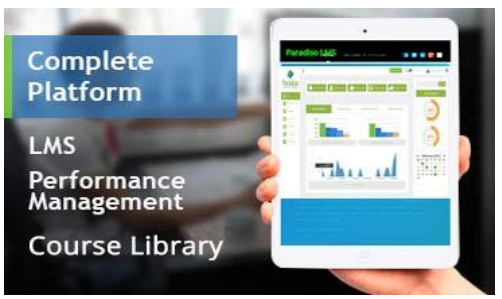
Why Paradiso LMS?

Primarily because our LMS is designed in a way that it is ready for your growth. It flaunts a super easy user interface, while rolling out a fully integrated e-learning portal that is power packed with features like social learning, gamification, multi-tenancy, eCommerce integration and more.